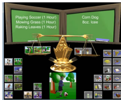
Finding the Balance Developed by Duke University's Center for Wellness

Finding the Balance and the Nutrition Ambition Interactive Edition can be delivered locally, over the web, or into the home from your school and/or District web server!